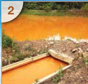
This polluted water is channeled through a series of wetlands and ponds that removes toxins and neutralizes the pH.