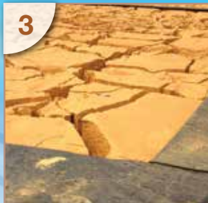
At a neutral pH, the iron can no longer stay in solution and precipitates out as iron oxide suitable for use as a pigment. When enough material is collected, it is harvested.