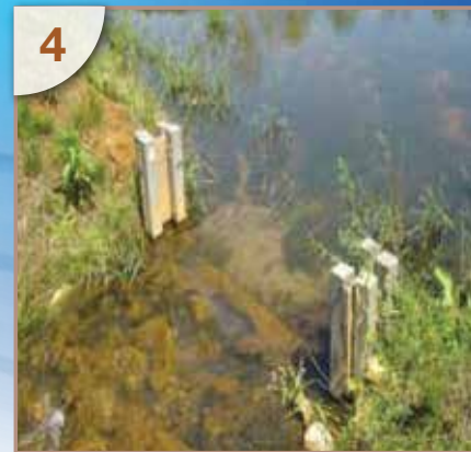
The result is CLEAN WATER that can be returned to the environment free from toxic residue.

Hoover Color pigments have been the industry standard since 1923. Whether you have a material or cost issue – or both - we can help. For engineered pigments with exceptional performance, quality and value, give us a call or email us today to get the conversation started. We will help you determine the right product for your specific application, and provide a sample for your evaluation.